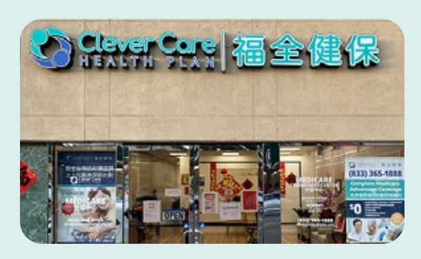
Monterey Park | 117 West Garvey Ave. #C Monterey Park, CA 91754

Our Koreatown Clever Care community center is staffed with bilingual English and Korean-speaking advisors.